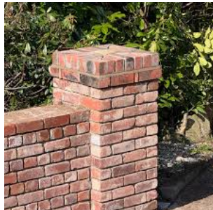
MASONRY COLUMN CAP DETAIL