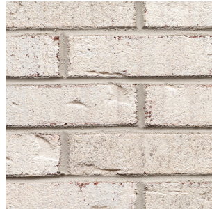
BRICK TO MATCH EXISTING RESIDENCE